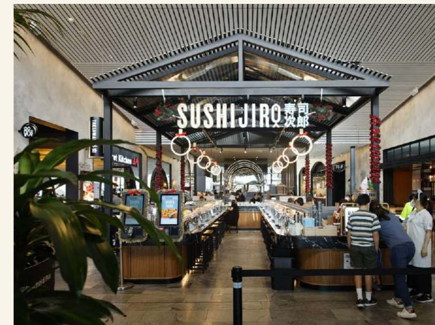
Westfield Doncaster Shopping Centre 619 Doncaster Rd, Doncaster