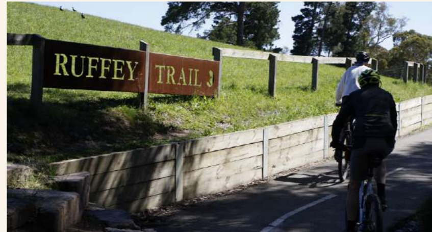
Ruffey Trail 15 Nambour Rd, Templestowe

There are countless reasons to make 5 Henry Street your home. Take five of our favourites that encapsulate the delight of living among the hills close to the heart of Doncaster.