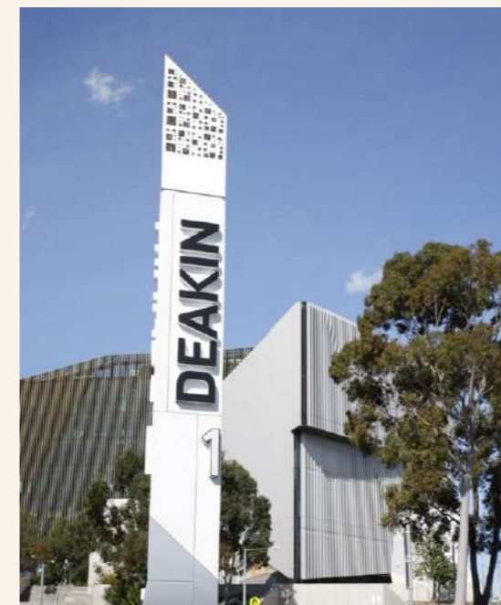
Deakin University 221 Burwood Hwy, Burwood