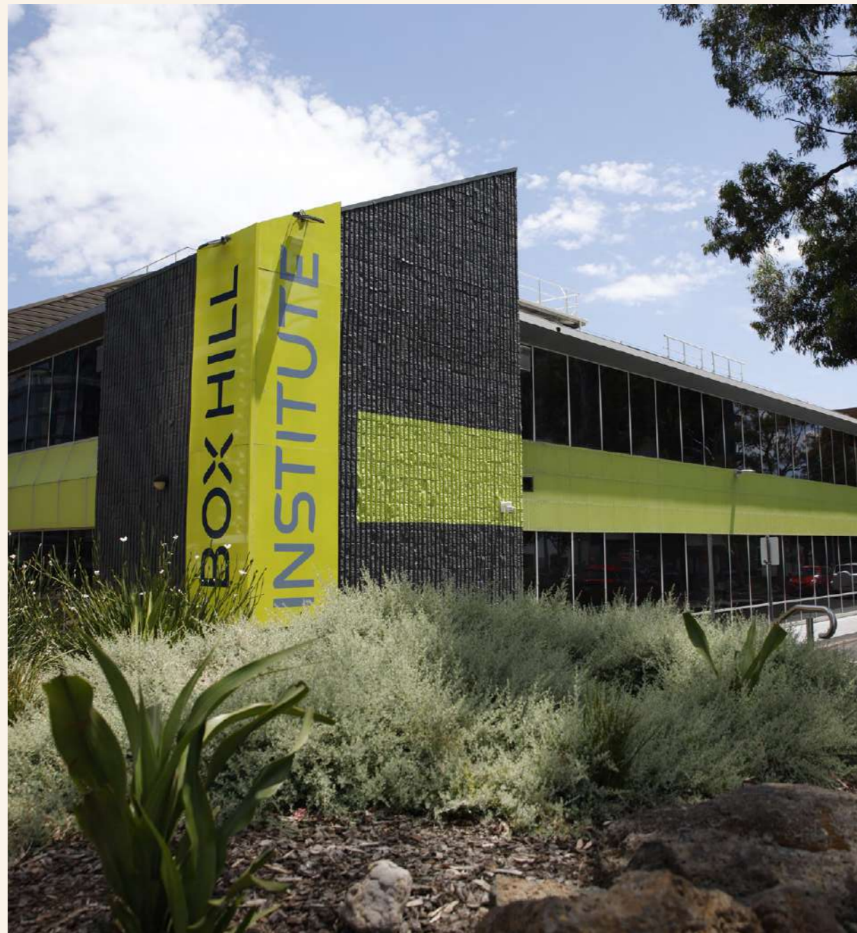
Box Hill Institute 465 Elgar Rd, Box Hill