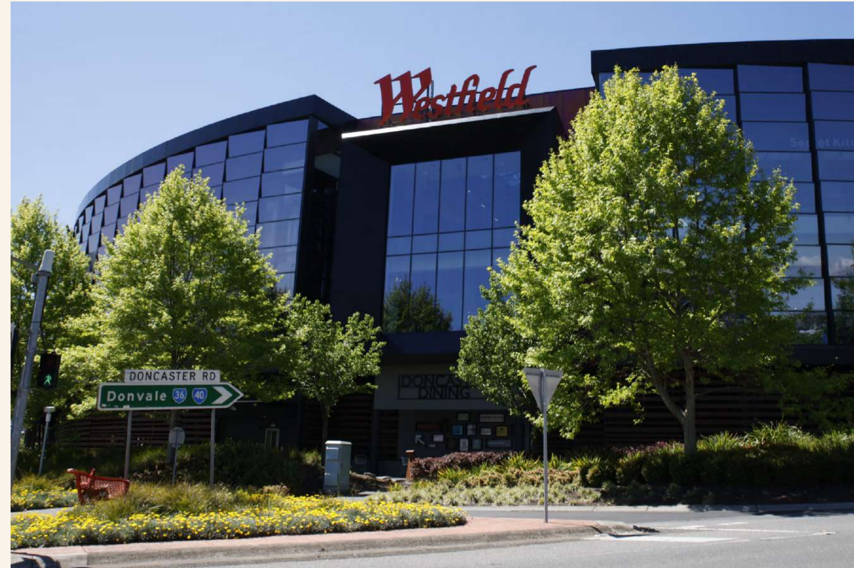
Westfield Doncaster Shopping Center 619 Doncaster Rd, Doncaster