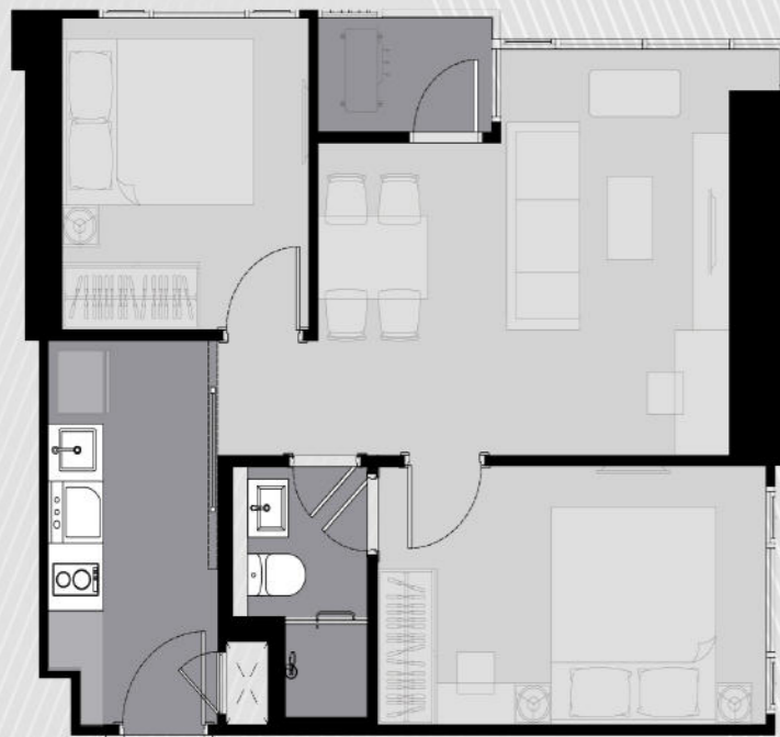
*Picture shows the division of the living space of each unit floor plan only may be different than actual interiors in accordance with the company's terms and conditions, Not included furniture.