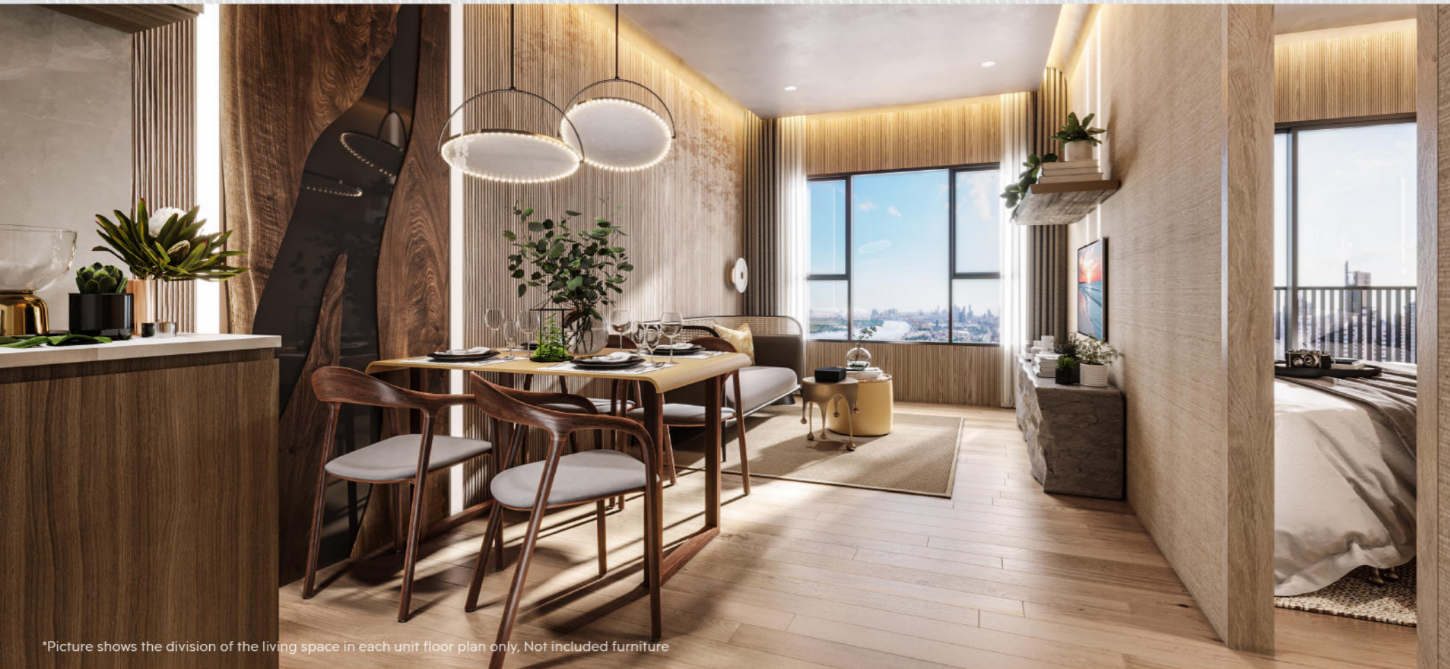
*Picture shows the division of the living space in each unit floor plan only, Not included furniture