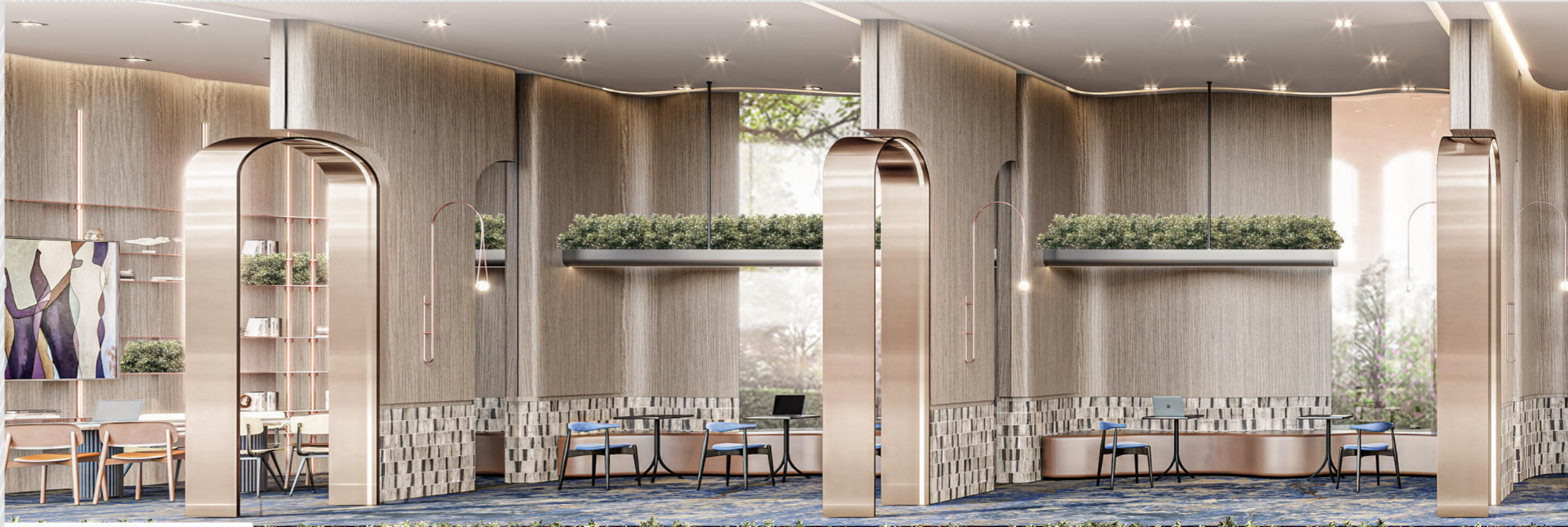
THE GREEN TUNNEL

*Pictured interior décor may be different than actual interiors in accordance with the company's terms and conditions.