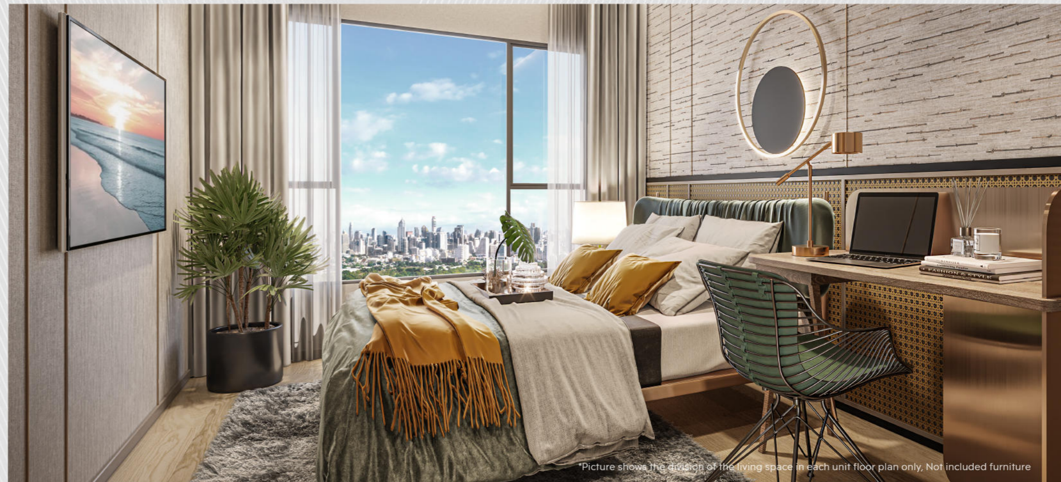
*Picture shows the division of the living space in each unit floor plan only, Not included furniture