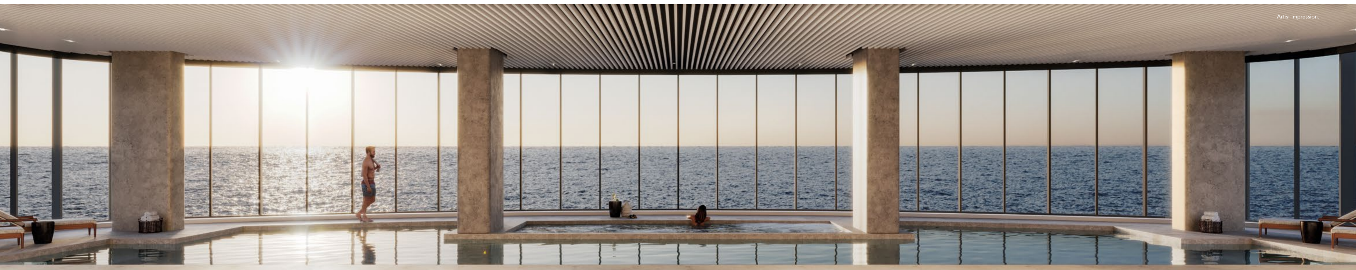
Indoor pool located on LEVEL 33