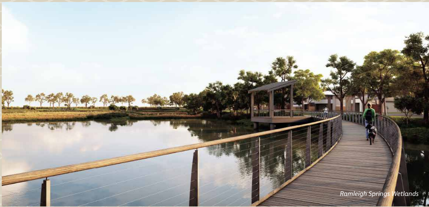
Ramleigh Springs Wetlands