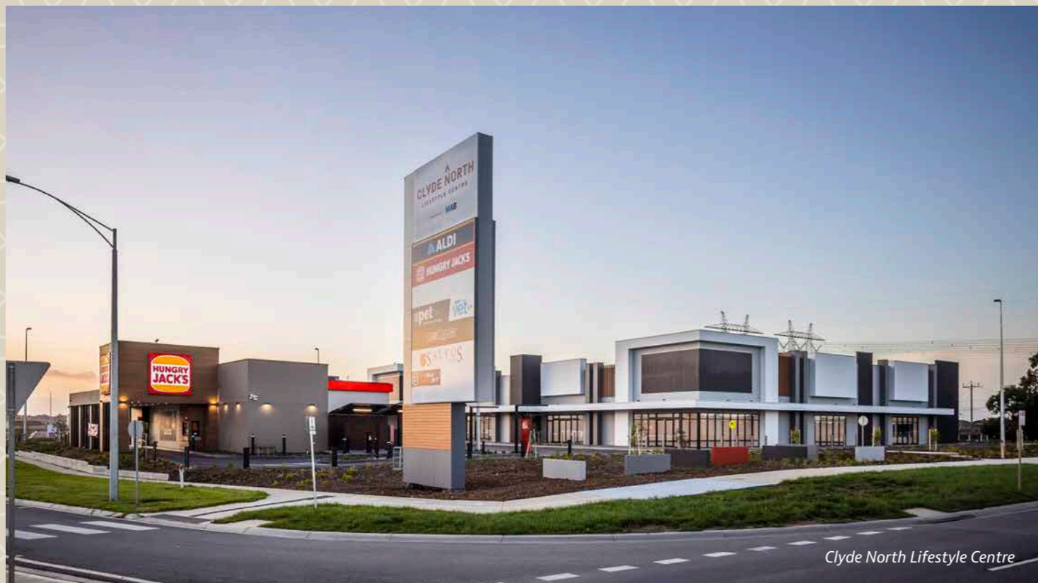
Clyde North Lifestyle Centre

'The Orchards' puts you close to the new Clyde North Lifestyle Centre which features Aldi and Petstock, the beautiful Ramleigh Springs Wetlands walking tracks, playground and dog park, and the new Bunnings.