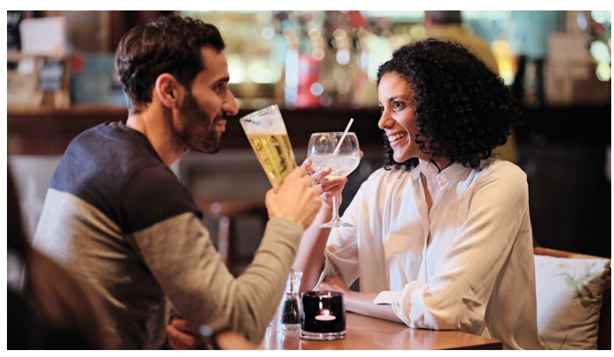
After-work drinks with friends