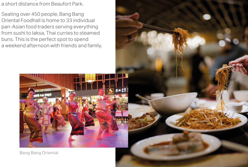
Noodles in the foodhall

Seating over 450 people, Bang Bang Oriental Foodhall is home to 33 individual pan-Asian food traders serving everything from sushi to laksa, Thai curries to steamed buns. This is the perfect spot to spend