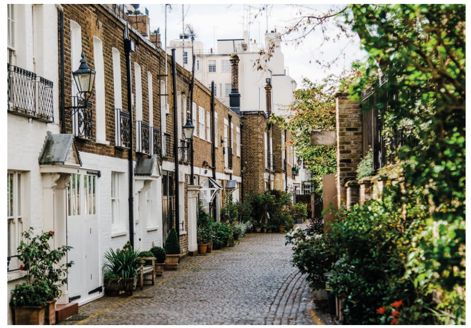
Streets of North London

Beaufort Park is a short journey from the vibrant heart of London city centre. Stay close to the nightlife, shopping, business and entertainment at the capital's heart.