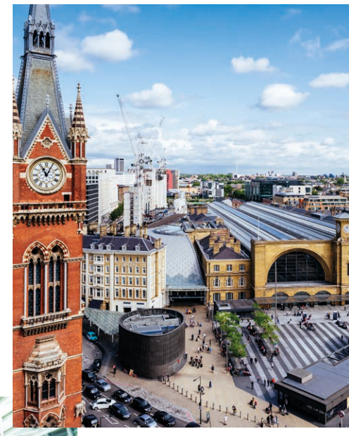
View of Kings Cross

A short 21 minute Tube ride away from Beaufort Park, King's Cross is easily accessed via the Northern line. Its proximity places countless job opportunities moments away from Beaufort Park.