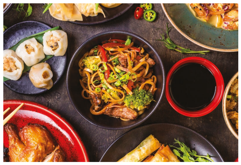
Bang Bang Oriental

The capital is renowned for its exciting architecture and scenery, modern and classical. Among these are London's nine Royal Parks and the endlessly changing vista of the River Thames.